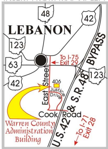
Tanning Commission (Planning Commission Planning Commission)